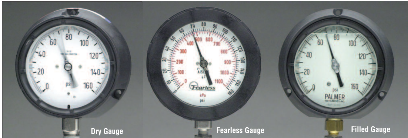
Fearless Gauge comparison to a Filled Gauge and a Dry Gauge under identical test conditions. Please note the effects of vibration on the Dry Gauge, as compared to the Fearless Gauge which is vibration and pulsation resistant, similar to a Filled Gauge.