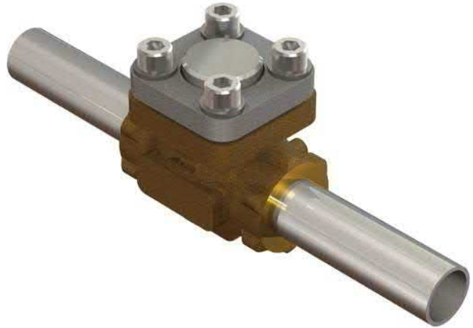
DN25 Bronze Lift Check Valve with Stainless Steel Stubs

All valves are degreased for oxygen duty, assembled in clean room conditions and pressure tested prior to dispatch.