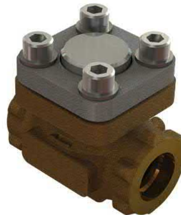
DN15 Bronze Lift Check Valve with Socket Ends

CE Marked according to the Pressure Equipment Directive.