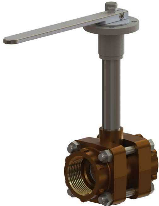
DN50 Bronze Ball Valve with NPT Threaded Ends

CE Marked according to the Pressure Equipment Directive