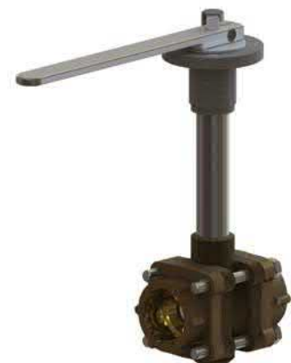
DN25 Ball Valve with NPT Threaded Ends