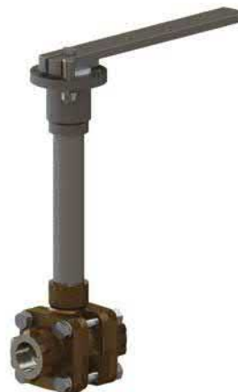
DN15 Ball Valve with NPT Threaded Ends